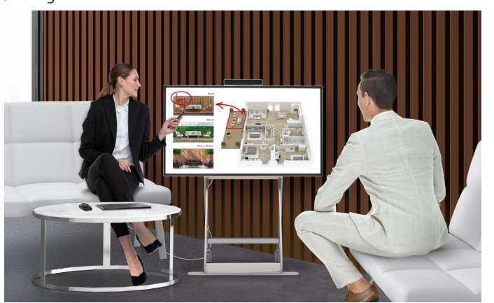
Have meetings and demonstrations with clients and contract in one place.