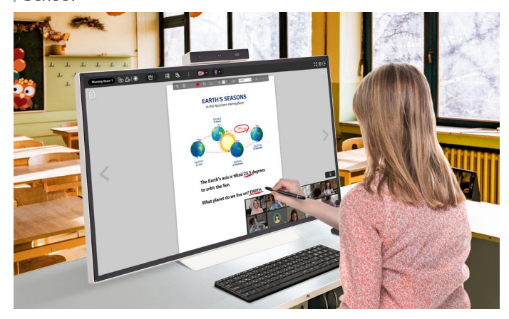
Write on teaching material and have remote lessons without any additional equipment.