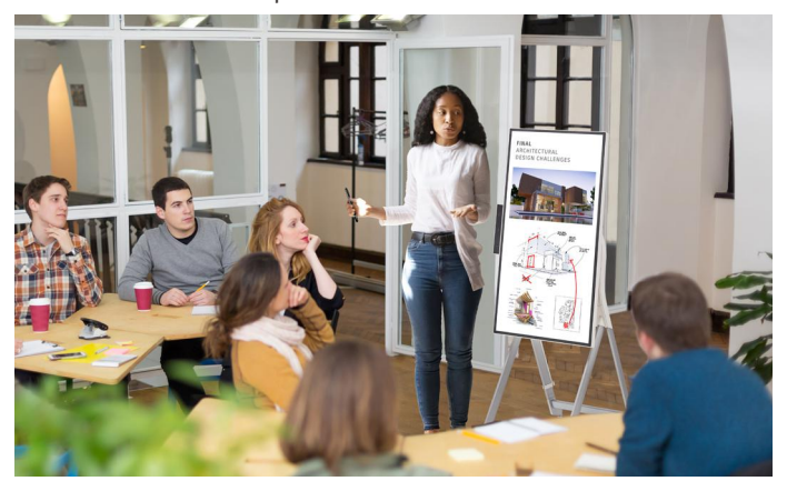
Employees can freely describe their creative ideas with drawing and writing.