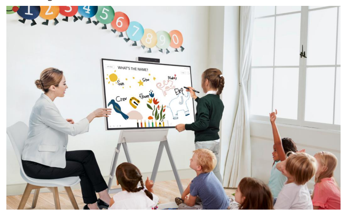
An interactive educational tool for the child, with which their drawings and writings from during class can be saved as image files.