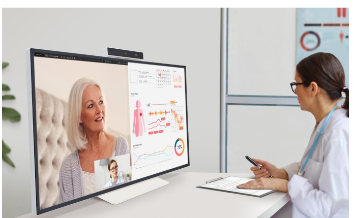
Perform simple consultations or medical examinations remotely without meeting with the patient.