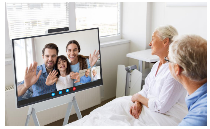
Re-connect with your family and relatives as if you were there.