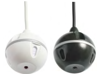
EasyMic Ceiling MicPODs (above) and EasyMic MicPOD (below)